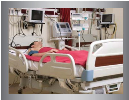
Medical-Grade (UL 60601-1 or UL 1363A) Power Strips Required