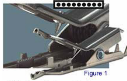
Figure 1 With fewer piercing points, the row-of-points style clip minimizes wire penetration and reduces the likelihood of breakage.

Choosing the appropriate test accessory can make the difference in how easily and efficiently the technician can complete the task at hand. For example, Pomona provides a wide selection of test accessories designed for use in both the Central Office and OSP (OutSide Plant). Some of these include patch cords and adapters with Bantam (DS1), WECO 310 (DS0), and coaxial 75-ohm BNC/Mini WECO/Standard WECO connectors. A complete family of piercing alligator test clips, primarily for use in the field, allows the technician to quickly access twisted pair lines with minimal risk of wire damage. Pomona's offering includes eight piercing Alligator Test Clip model configurations to meet a variety of multi-purpose test requirements, including piercing wire sizes from 14 to 26 AWG (Figure #1). One of the newest piercing clip styles features a "row of points" configuration that is attached to a banana or bantam plug. With fewer piercing points, the "Row of Points" clip minimizes wire penetration and reduces the likelihood of breakage