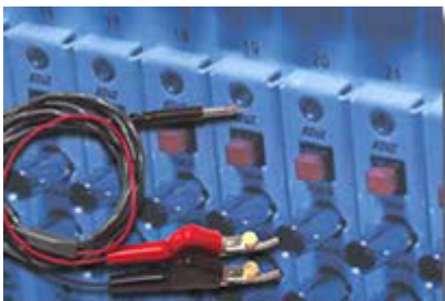
Alligator clip test leads assist technicians in accessing the wire to be tested with minimal risk of damage to the wire.

The biggest challenge facing the technician is to develop the necessary skills to hook up to the system, locate the problem, and fix it as quickly as possible. Additionally, it is critical to fix each problem on the initial visit. Repeat calls for the same problem are both costly and inconvenient to the customer. Choosing appropriate equipment and accessories will help the technician isolate the problem correctly on the first visit, and ensure the problem is fixed quickly and accurately. Technicians must also develop the skills needed to perform line qualification and fault isolation tests encompassing a variety of analog and digital transmission formats. Examples include high-bandwidth xDSL (Digital Subscriber Lines), ISDN (Integrated Services Digital Networks), SONET (Synchronous Optical Network) and ATM (Asynchronous Transfer Mode). The tremendous number of combinations of potential physical faults, data transmission errors, and non-conforming protocols all add to the complexity of fault isolation and emphasize the need for having the proper equipment and accessories readily available.